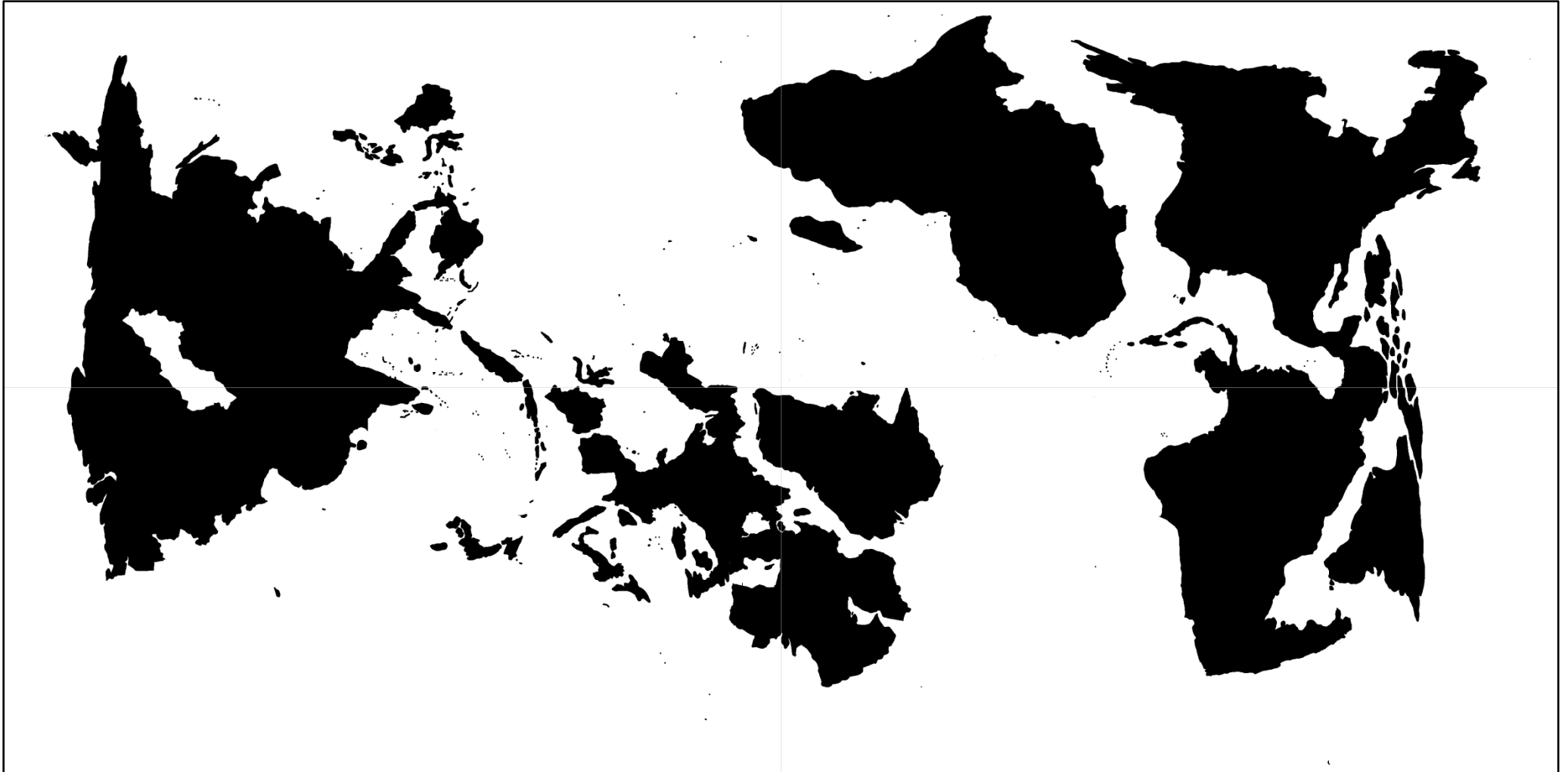
Map 2: Simple black-and-white map with the equator and prime meridian